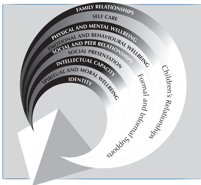
FIGURE 1.2 ALL PARTS OF CHILDREN'S LIVES ARE INTERLINKED